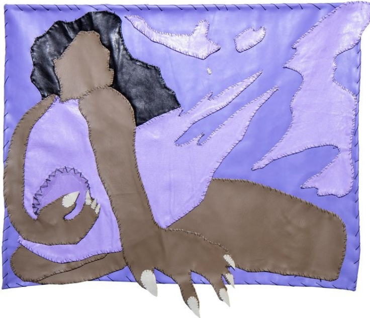
Sophie Utikal Big, Curly, Soft and Wavy 2023 Leather and leatherette, hand sewn textil collage with silk thread 67 x 82 cm