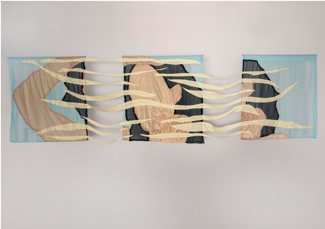
Sophie Utikal Irregularity, Inbetween, I 2023 Cotton and polyester mix, hand sewn textil collage with silk thread 100 x 400 cm