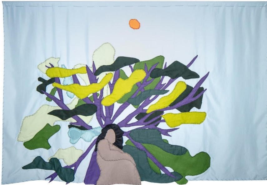
Sophie Utikal Protected 2023 Cotton and polyester mix, hand sewn textil collage with silk thread 100 x 150 cm