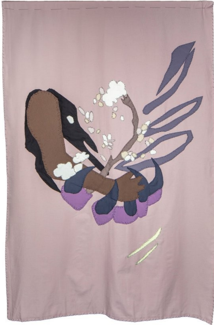
Sophie Utikal From Within 2023 Cotton and polyester mix, hand sewn textil collage with silk thread 131 x 87 cm