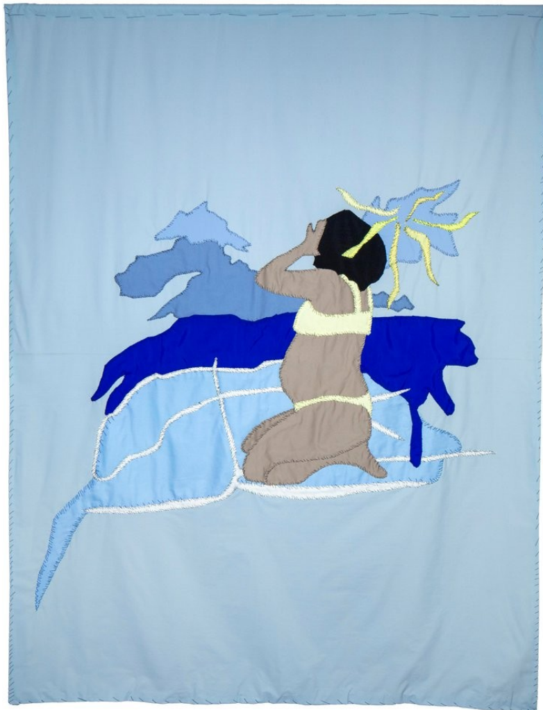
Sophie Utikal Horizons Dissolved 2023 Cotton and polyester mix, hand sewn textil collage with silk thread 154 x 121 cm