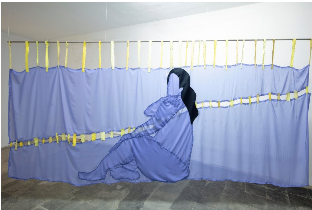
Sophie Utikal See Me Through 2023 Cotton and polyester mix, hand sewn textil collage with silk thread 180 x 370 cm