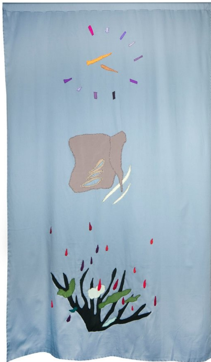
Sophie Utikal Turning Inside Out 2023 Cotton and polyester mix, hand sewn textil collage with silk thread 171 x 100 cm