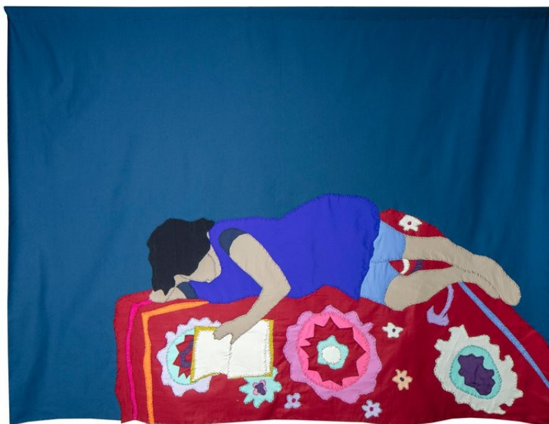
Sophie Utikal Finding My Own 2023 Cotton and polyester mix, hand sewn textil collage with silk thread 114 x 152 cm