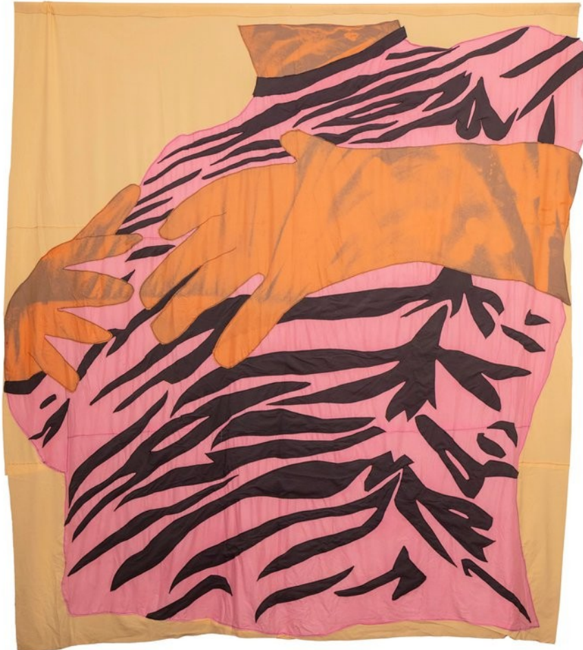
Sophie Utikal Inner World (Full Melt Down) 2021 Cotton and polyester mix textil collage sewn with silk thread 390 x 350 cm