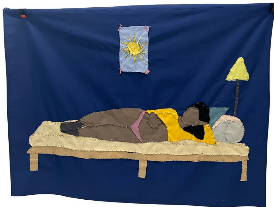
Sophie Utikal Waiting for the Sun // Two in One 2023 Cotton and polyester mix, hand sewn textil collage with silk thread 105 x 140 cm