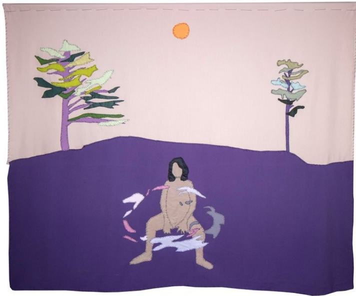
Sophie Utikal As the world begins again and again 2023 Cotton and polyester mix, hand sewn textil collage with silk thread 110 x 134.5 cm