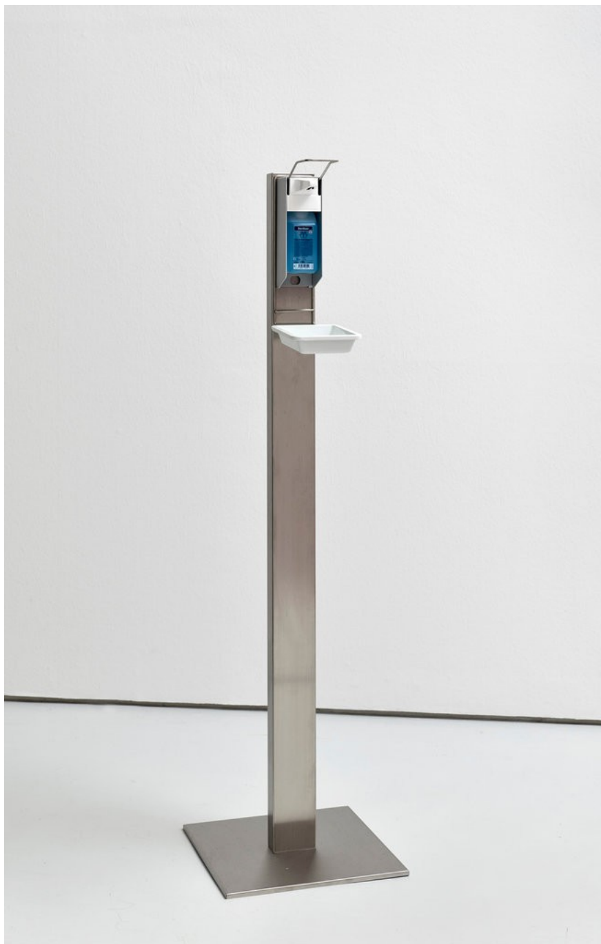
Jens Pecho Scent Piece for My Mother 2019 desinfectant, dispenser 150 x 32 x 25.8 cm Edition 3 + 2 AP