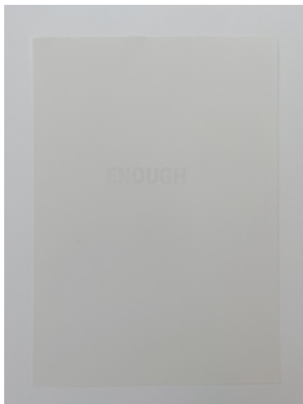
Tim Etchells Enough (I) 2023 Ink/monoprint on archival paper A4 29 x 21 cm