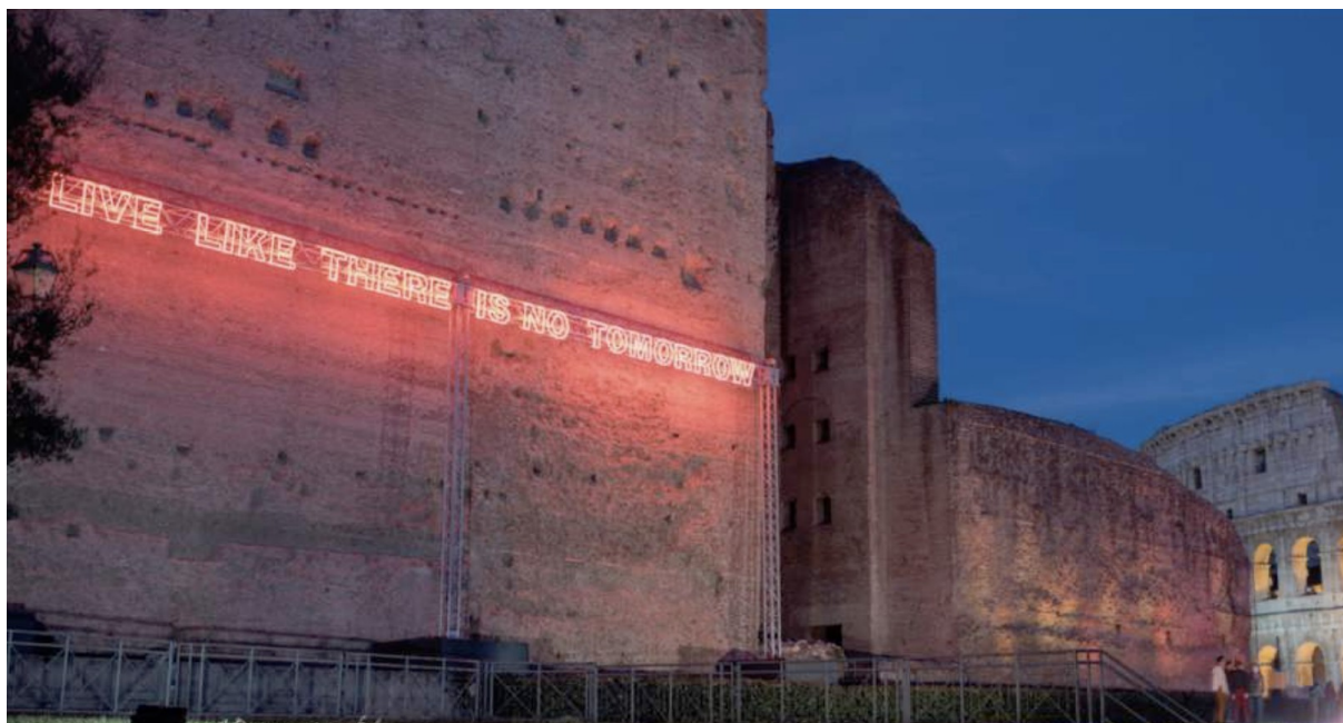
Tim Etchells Installation view of Live Like for Insieme Festival Rome, 2020