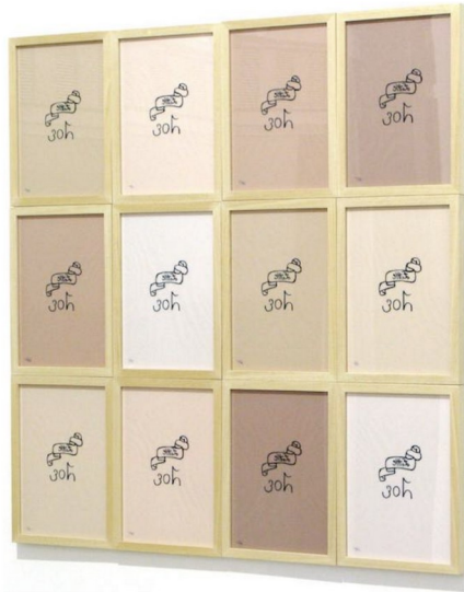
Hajnal Németh Tattoo all of You 2010 Ink on wax paper, 12 sheets, 29,7 x 21 cm each 3 + 1 AP