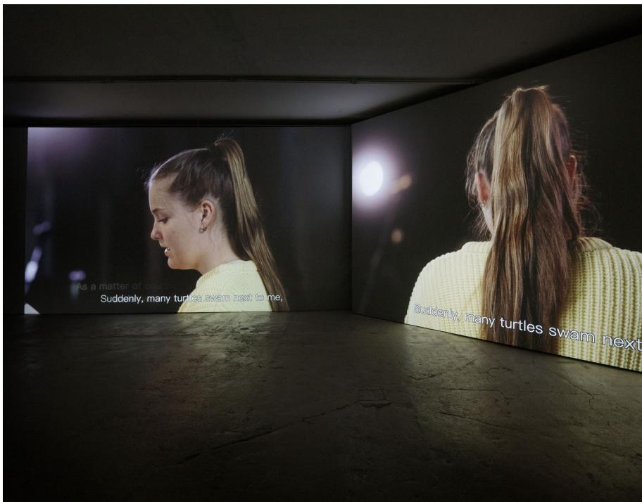
Hajnal Németh Dream Exchanges – Fear of Music, Trust in Twelve 2022 2 channel video installation with quadrophonic sound 27' Edition of 5 + 2 AP