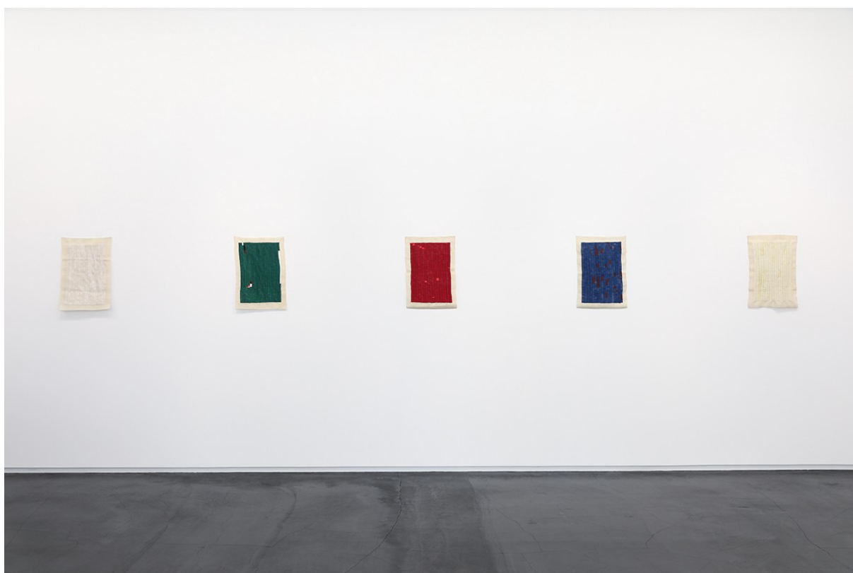
Kei Takemura Installation view of Time Counter at taka Ishii Gallery, 2019