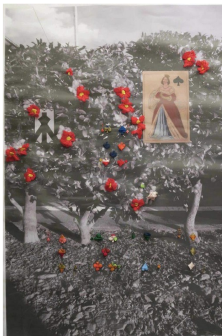
Kei Takemura The Cards Tell You Nothing but A Life for Second 5, 2017 Assemblage, colour print on fabric, Japanese silk thread, synthetic fabric 100 x 70 cm